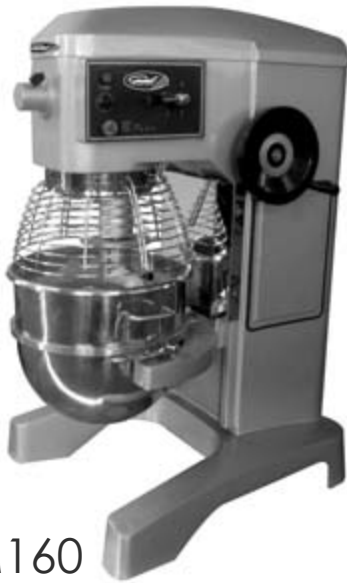
GEM160 60 Quart Mixer